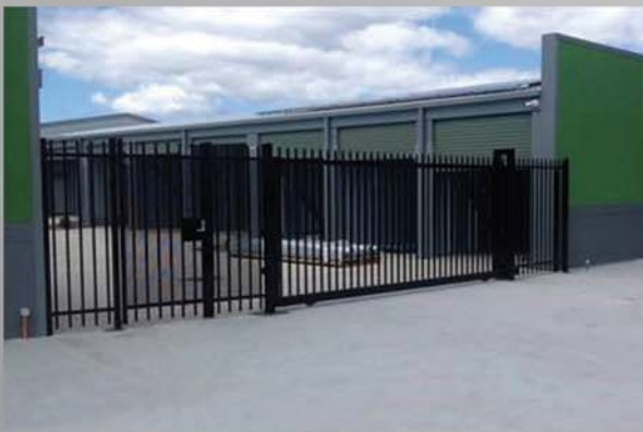
Sliding gate with a pedestrian gate